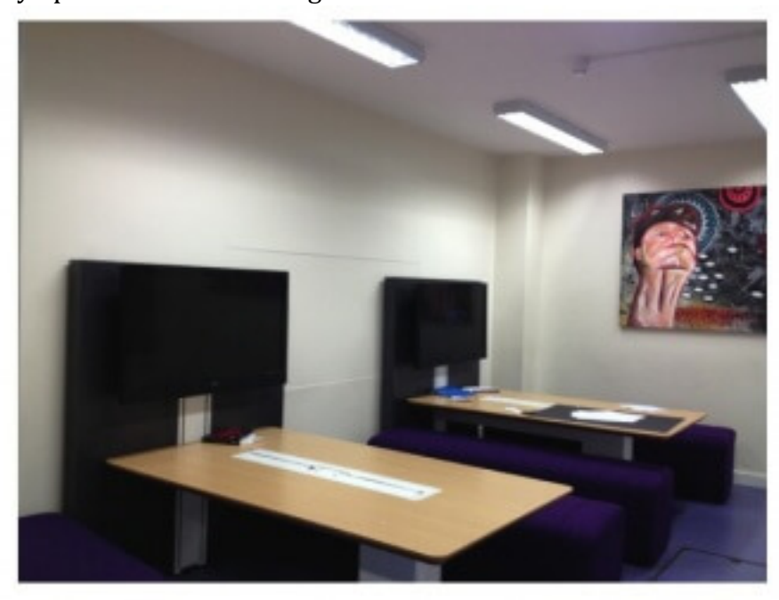
Collaborative working desks with iPad connections and Apple tv in the 6th form centre, meeting rooms and assembly halls

devices is in flux. The Network Support team investigated wireless access and security options in other settings.